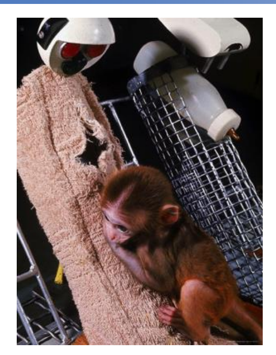
Harlow, H.F., & Harlow, M. (1966) Learning to love. American Scientist 54: 244-272.